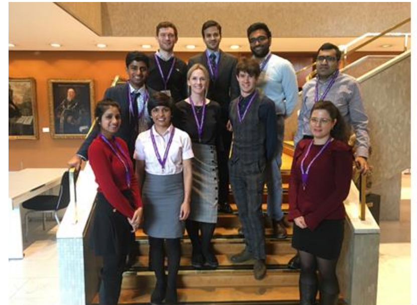
Royal College of Physicians Student and Foundation Doctor Network