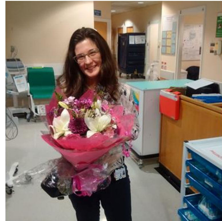
Bouquet of flowers from a lovely patient

Rheumatology/Gastro-Genitourinary Medicine clinics/Geriatrics